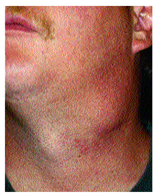
FIGURE 3. Clinical appearance of cervical lymph node metastasis to the submandibular triangle of the neck.

Metastatic disease to lymph nodes of the neck from a head-and-neck primary site usually follows well-defined patterns<sup>31,32</sup> ( Figure 2 ). For example, cancers of the oral cavity typically metastasize to the submandibular triangle ( Figure 3 ), whereas cancers from most other sites in