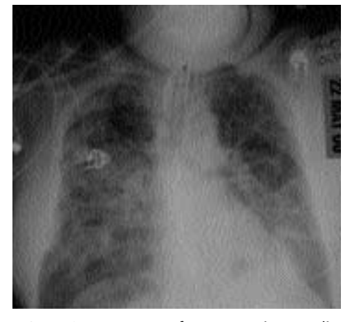
FIGURE 2. Late stage of acute respiratory distress syndrome showing bilateral and diffuse alveolar and reticular opacification.

In patients with direct pulmonary insults, focal changes may be evident early on chest radiograph. In nondirect insults, the initial radiograph may be nonspecific or similar to congestive heart failure with mild effusions. Thereafter, interstitial pulmonary edema develops with diffuse infiltrates ( Figure 1 ). As the disease progresses, the characteristic bilateral diffuse alveolar and reticular opacities become evident ( Figure 2 ). Complications such as pneumothorax and pneumomediastinum may be subtle and difficult to identify, particularly on portable radiographs and in the face of diffuse pulmonary opacification. The patient's clinical course may not parallel the radio-