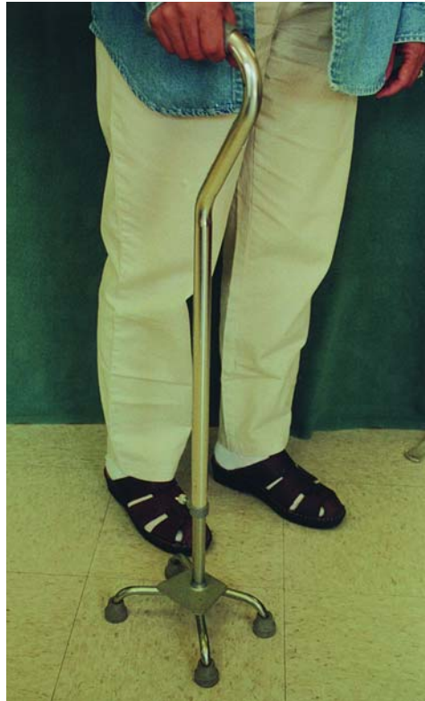
FIGURE 4. Multiple-legged, or “quad cane.” The four points of the cane should simultaneously contact the floor.