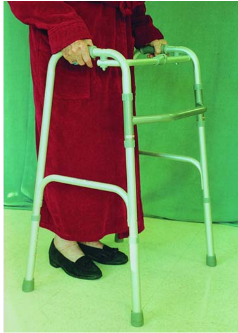
FIGURE 8. Standard walker. The patient must be able to lift the standard walker off the ground.