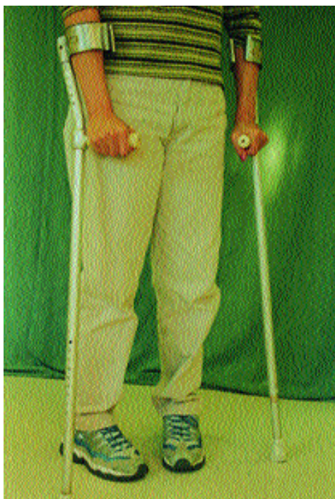
FIGURE 7. Forearm crutch. This device also is known as the Canadian crutch or Lofstrand crutch.

patient who had a stroke with hemiparesis and who has moderate to severe loss of lower-extremity function would be a candidate for this device.