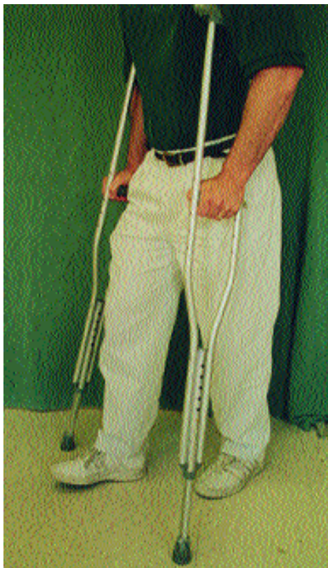
FIGURE 6. Axillary crutch. This crutch requires considerable strength to use and is generally used on a temporary basis.