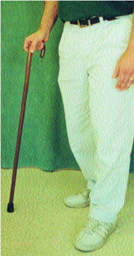
FIGURE 1. Standard wooden cane, which must be custom fitted for length.

deficit. The cane is then advanced with the opposite (deficient) leg, consistent with normal gait.