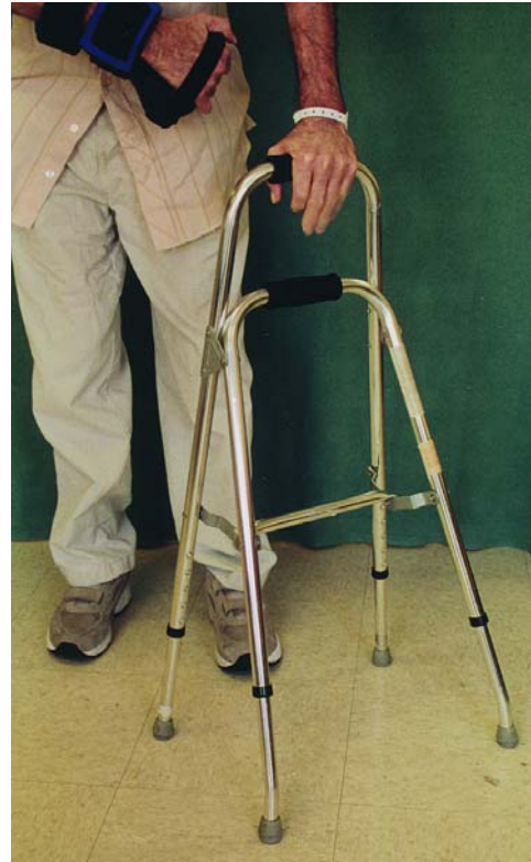
FIGURE 5. Walk cane. Walk canes are best for patients requiring continuous weight bearing using only one hand.

can be used by patients who have need for occasional weight bearing. Offset canes can thus be prescribed for patients with painful gait disorders, such as mild to moderate antalgic gait caused by hip or knee osteoarthritis.