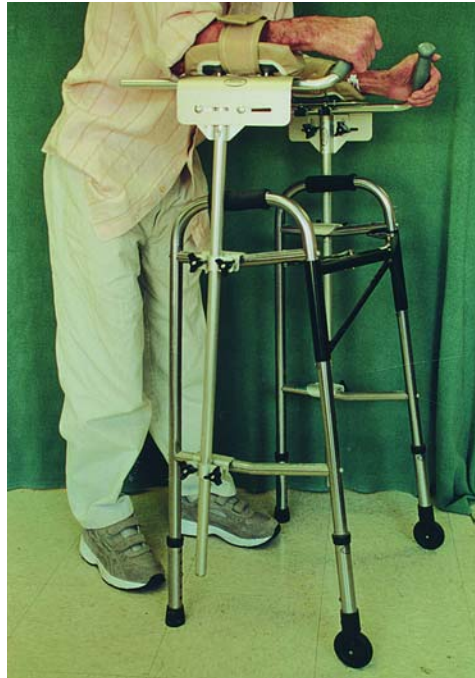
FIGURE 12. Platforms. Crutches and walkers can be fitted with platforms to redistribute body weight so the device can be used without putting stress on the wrist or forearm. In this photograph, bilateral platforms have been installed on a front-wheeled walker.

at the patient's side. 16,17 Again, a properly measured device will permit the patient's elbow to be flexed to 15 to 30 degrees when holding the device in contact with the floor.