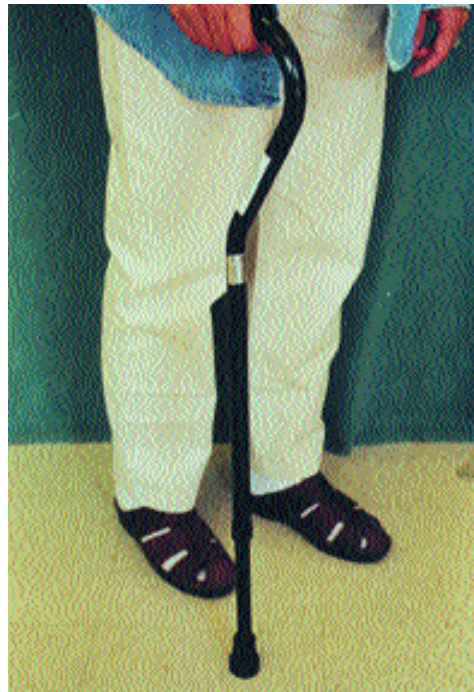
FIGURE 3. Offset cane. The length is adjustable.