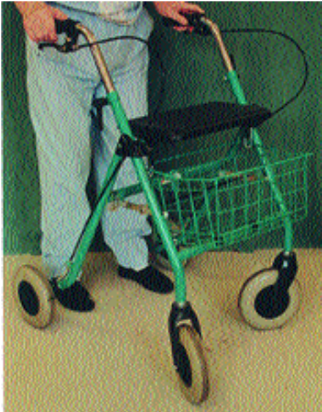
FIGURE 10. Four-wheeled walker. This device provides a large base of support but can roll away if it is used for full weight bearing.

of cane will then be determined by the need and frequency to bear weight.