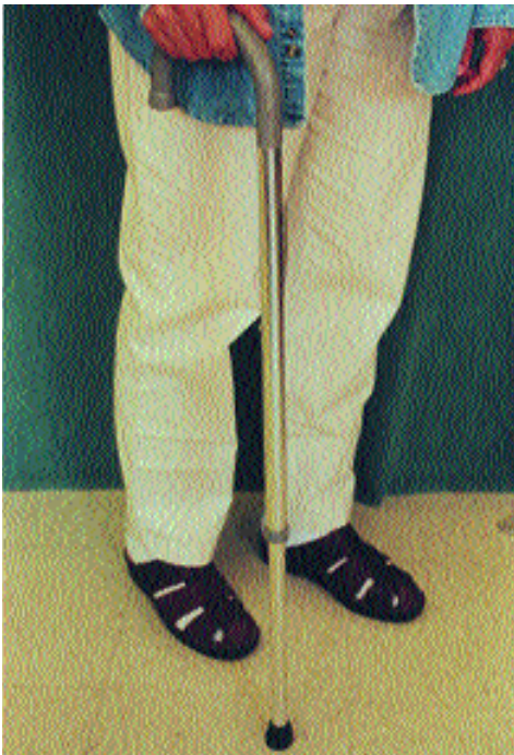
FIGURE 2. Standard aluminum cane. The length is adjustable.

In contrast to standard canes, offset canes