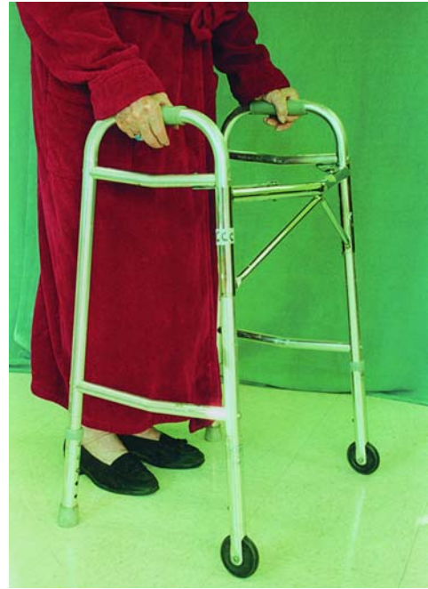
FIGURE 9. Front-wheeled walker. The addition of wheels improves gait but decreases stability.

Despite the enhanced support and utility for weight bearing, walkers also have disadvantages. These include difficulty maneuvering the device through doorways and congested areas, reduction in normal arm swing, and poor posture with abnormal flexion of the back while walking. In general, walkers should not be used on stairs.