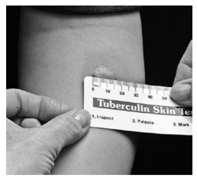
Figure 1. Tuberculin skin test (TST) result. When interpreting a TST result, the transverse diameter of induration, not erythema, is measured in millimeters. The induration should be measured across the forearm, perpendicular to the long axis. The result in this figure should be recorded as 16 mm. The 0 mm ruler line is inside the edge of the left dot.

Rates of false-negative TST results are as high as 10 to 20 percent in patients with proven M. tuberculosis infection and no apparent immunocompromising conditions.<sup>12,15</sup> Anergy testing is not recommended for persons with HIV infection because of variations in response over time, or for other patients because of insufficient evidence to support such testing.<sup>15</sup> There are many confounders that lead to false-negative and false-positive results ( Table 3 ).<sup>16,17</sup> Bacille Calmette-Guérin (BCG) vaccination, used in highly endemic areas throughout the world to prevent disseminated forms of tuberculosis in infants and young children, is a noteworthy cause of false-positive results.<sup>11</sup> TST reactivity caused by the BCG