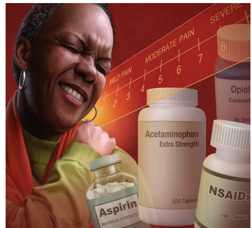
ILLUSTRATION BY TODD BUICK

Acute and chronic pain have been increasingly recognized as being on a continuum, with their development influenced by the initial pain experience and individual biopsychosocial factors. 1 A survey involving adults showed that during a three-month period, 29% experienced low back pain, 17% experienced a migraine or severe headache, 15% experienced neck pain, and 5% experienced facial or jaw pain. 2 In a survey of ambulatory office visits, analgesics were the most commonly continued or newly prescribed medication at a rate of 11.4%. 3