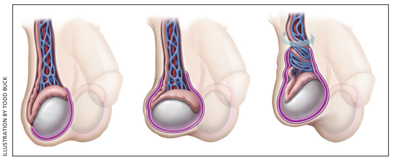
Figure 1. The bell-clapper deformity with abnormal fixation of the tunica vaginalis to the testicle.

The differential diagnosis of the acute scrotum is