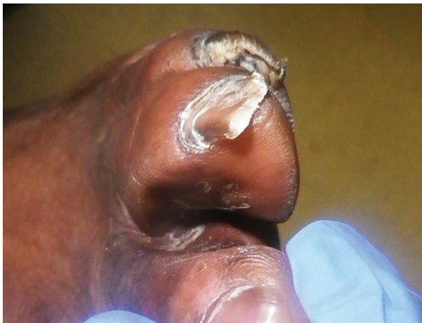
Figure 2. Severe interdigital intertrigo with erythema suggestive of cellulitis.

Interdigital intertrigo (Figure 2) may be mild and asymptomatic, but also may lead to intense erythema and desquamation. The affected skin may have a foul odor and may be macerated and ulcerated with copious or purulent discharge. Patients with interdigital intertrigo and comorbidities such as obesity or diabetes are at greater risk of cellulitis. 3 Interdigital intertrigo can progress to a severe bacterial infection with pain, mobility problems, erysipelas, cellulitis, abscess formation, fasciitis, and osteomyelitis causing pain so severe that the patient is unable to ambulate. 3 Web space infections are typically caused by gram-positive cocci such as Staphylococcus and Streptococcus and may cause