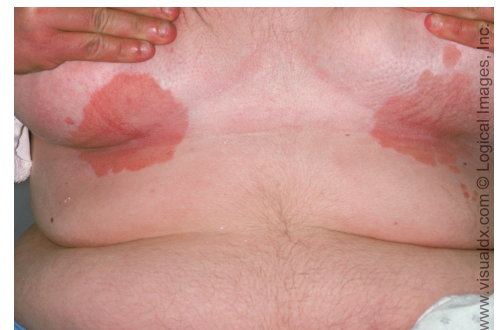
Figure 1. Inframammary intertrigo appearing as skin discoloration with no evidence of fungal or bacterial superinfection.

Intertrigo is often a chronic disorder that begins insidiously with the onset of pruritus, stinging, and a burning sensation in skin folds. Physical examination of the skin folds usually reveals regions of erythema with peripheral scaling. Intertrigo associated with a fungal superinfection may produce satellite papules and pustules. Candidal intertrigo ( Figure 3 ) is often associated with a foul-smelling odor. In the presence of a bacterial superinfection, plaques and abscesses may form. 8