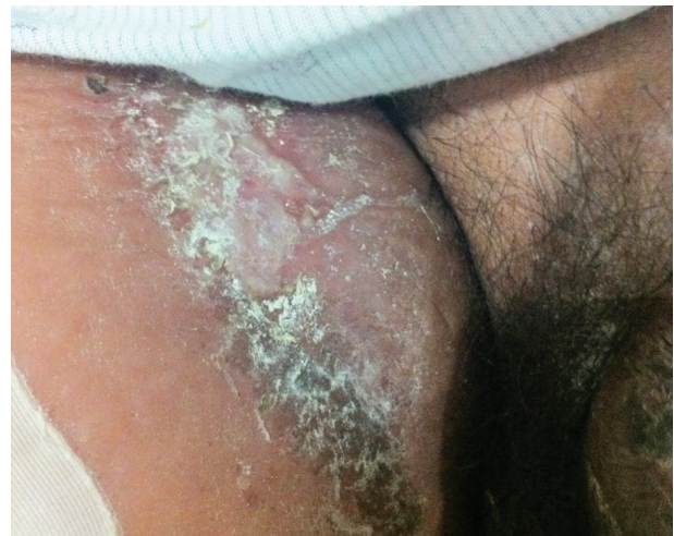
Figure 3. Candidal intertrigo in the inguinal fold.

The diagnosis of secondary fungal infections is commonly made clinically, based on the characteristic appearance and distribution of satellite papules and pustules. 11 The diagnosis may, however, be confirmed with a potassium hydroxide preparation positive for pseudohyphae and spores. Additionally, a potassium hydroxide preparation, Wood lamp examination, or culture of skin scrapings can diagnose conditions such as Candida or dermatophyte infections. The presence of hyphae on potassium hydroxide examination confirms dermatophytic lesions, including tinea versicolor and tinea corporis, and the presence of pseudohyphae confirms Candida infection. A video showing a potassium hydroxide examination of a fungal infection is available at http://www.youtube.com/watch?v=uqeMsyEDJaw . The Wood