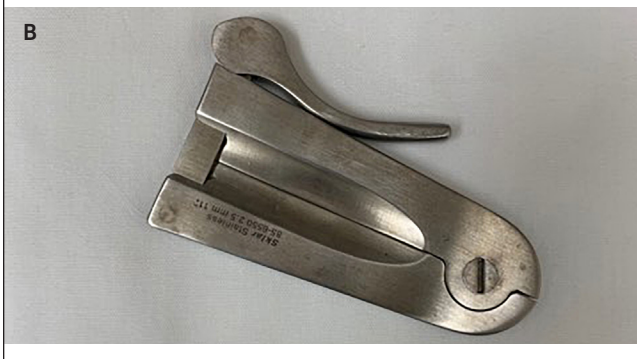
Mogen clamp in the open (A) and closed (B) positions.

0.2- to 0.4-mL injections on either side of the midline at the base of the penis ( Figure 4A ), and a ring block requires a 0.8-mL injection circumferentially around the base of the penis ( Figure 4B ). A 2004 Cochrane review found that the ring block or dorsal penile nerve block is more effective than topical lidocaine/prilocaine alone.<sup>28</sup> A sucrose pacifier (i.e., sucrose solution squirted in the mouth followed by a pacifier) is another analgesic option.<sup>26</sup> A recent randomized controlled trial comparing lidocaine/prilocaine cream alone with combination analgesics (lidocaine/prilocaine