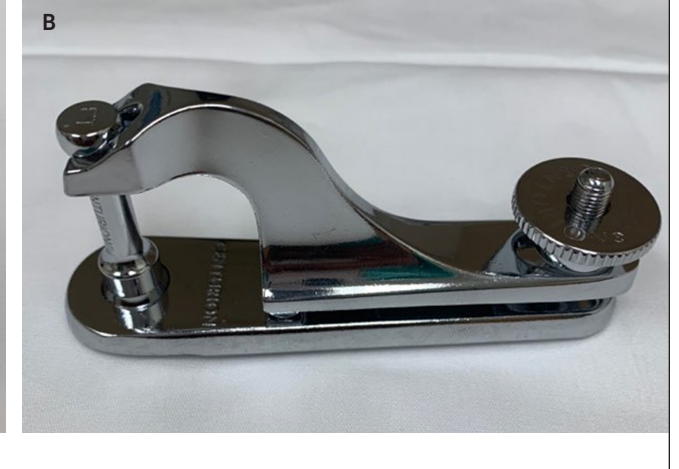
Gomco clamp in the open (A) and closed (B) positions.